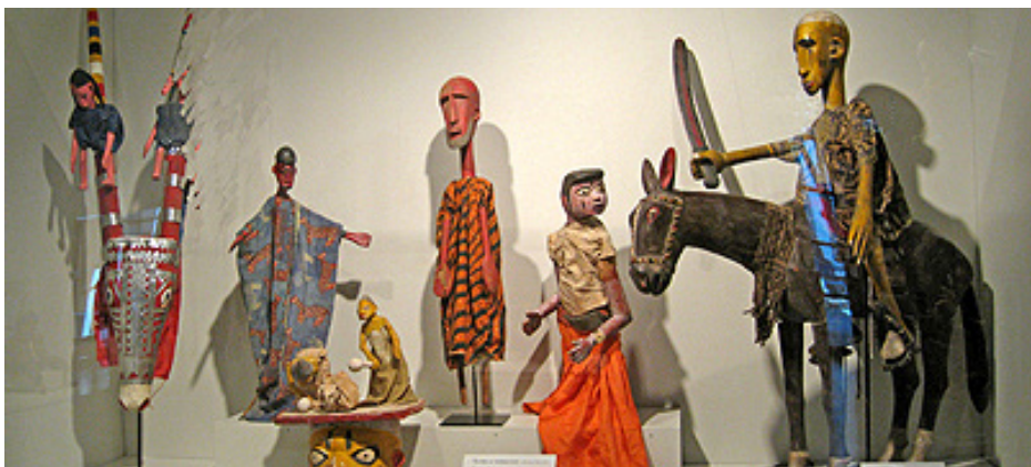
African Puppets from the International Puppetry Museum

A common variation on the animal-mask theme is the composition of several distinct animal traits in a single mask, sometimes along with human traits. Merging distinct animal traits together is sometimes a means to represent unusual, exceptional virtue or high status.