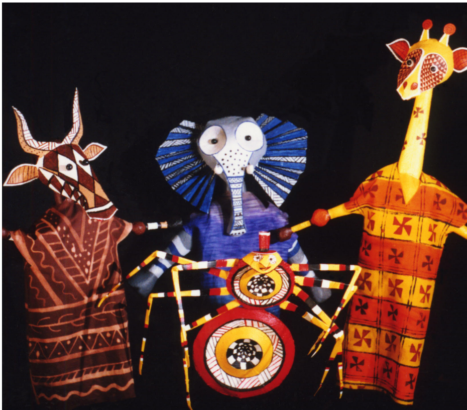
Anansi, Spiderman of Africa created in 1999 by Crabgrass Puppet Theatre