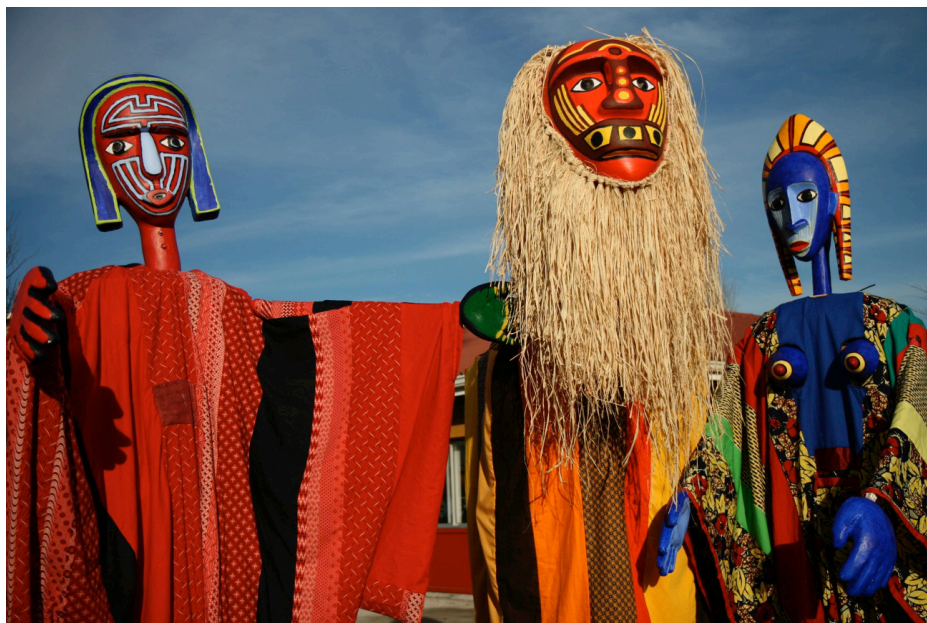
Janni Younge Productions

It requires careful thought for a puppet to be involved in a Physical Education lesson! But a puppet can offer ideas for movement, can give praise for effective team work or improved performance and can be used as an expert to talk about the health benefits of physical activity.